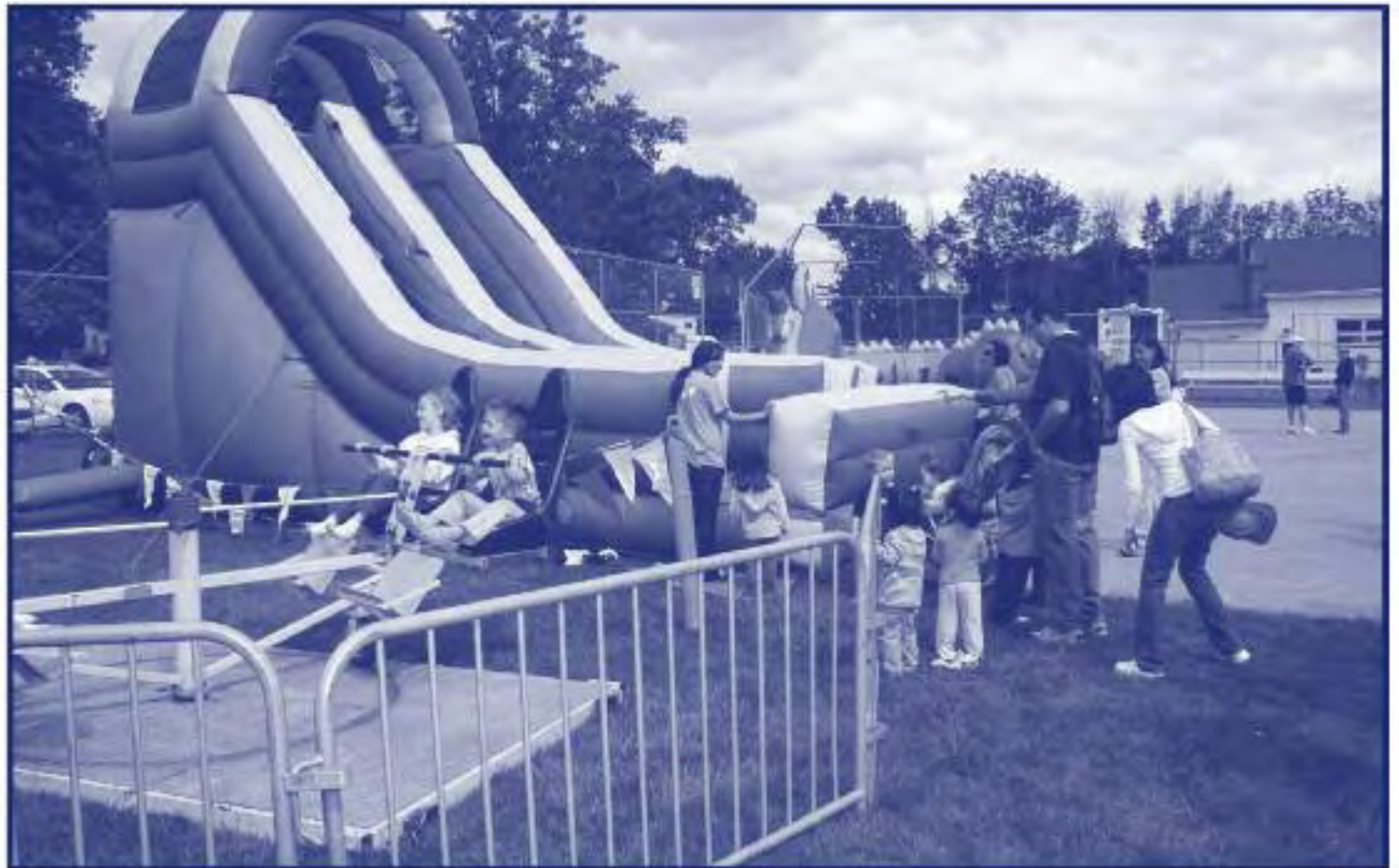
Warwick Day 2009